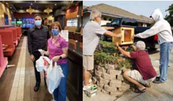
• Rotary Supports Restaurants