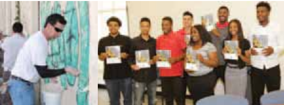
• Graffiti Removal