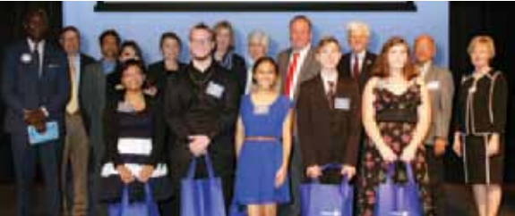
• Good Character Youth Awards