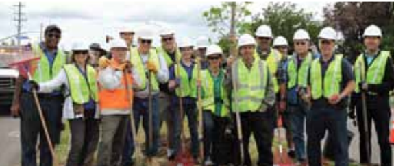
• City of Suisun Tree Donation & Planting