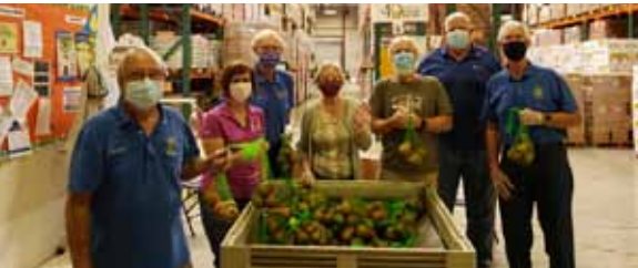
• Food Bank